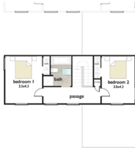
▲ FIRST FLOOR