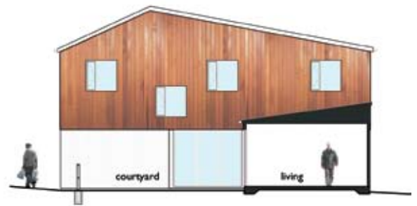
▲ WEST ELEVATION