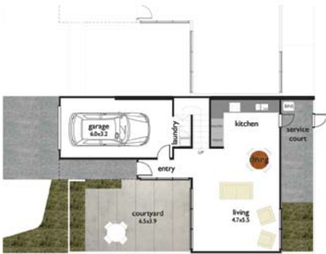
▲ GROUND FLOOR