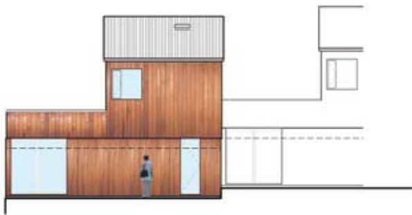
▲ SOUTH ELEVATION