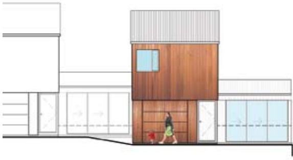
▲ NORTH ELEVATION