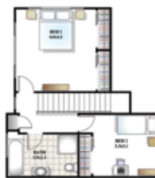
< 87B KENTWOOD STREET FIRST FLOOR