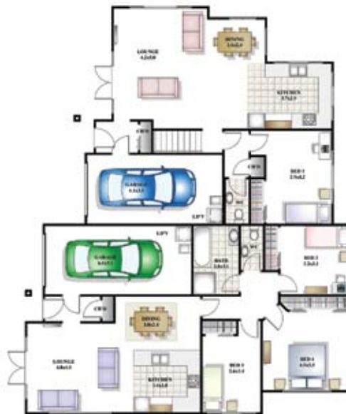
< 87B KENTWOOD STREET GROUND FLOOR