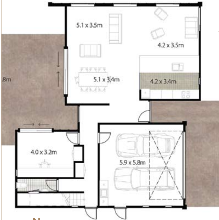
< GROUND FLOOR